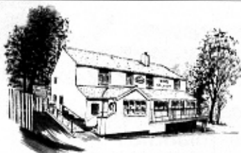
The King William Chapeltown Road