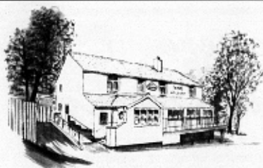
The King William Chapeltown Road