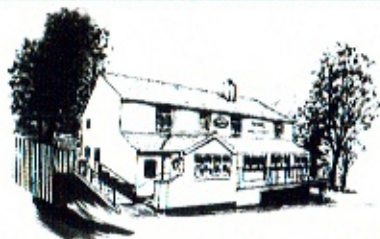
The King William - Chapeltown Road